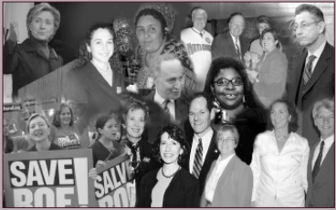
Celebrating 28 years of advocacy for reproductive health care